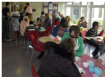
Café in full flow!

The young people involved found it an extremely useful experience and learned a lot about customer care. They are rightly very proud of their efforts and looking forward to their next one on Friday 24th March to raise money for Comic Relief.