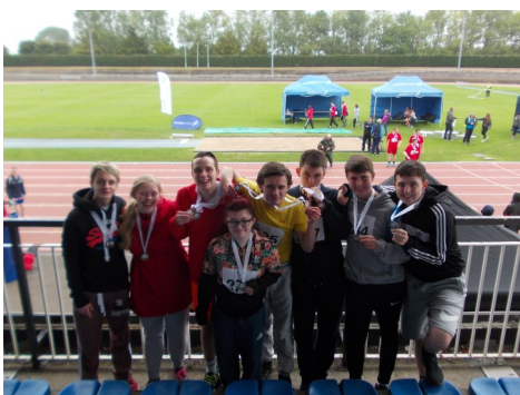
Our triumphant track and field stars