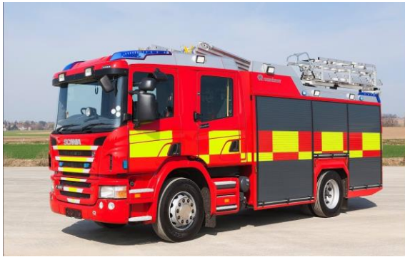
The Fire service